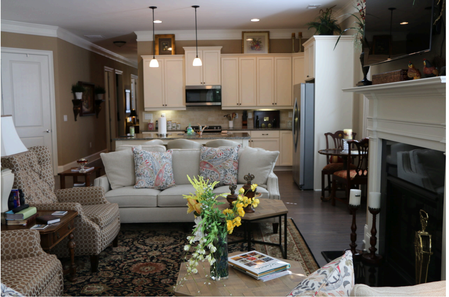
Floor Plan Features & Photos

This spacious and beautifully built, one-story cottage residence has all the features one would desire in a new home. The floorplan is graciously open and connects the kitchen, living room and dining room in an accommodating manner through to the garage. Hardwood flooring throughout, with 9ft. ceilings and crown molding with tray ceiling in the large master bedroom make for relaxed living.